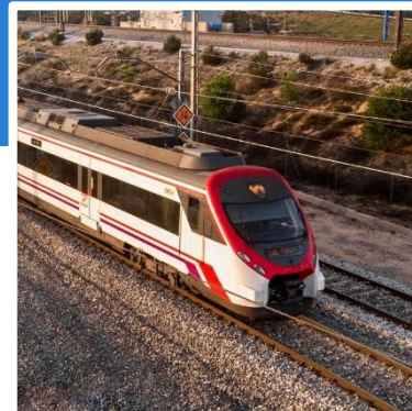
Railway & Rolling Stocks