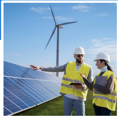
Alternative & Renewable Energies